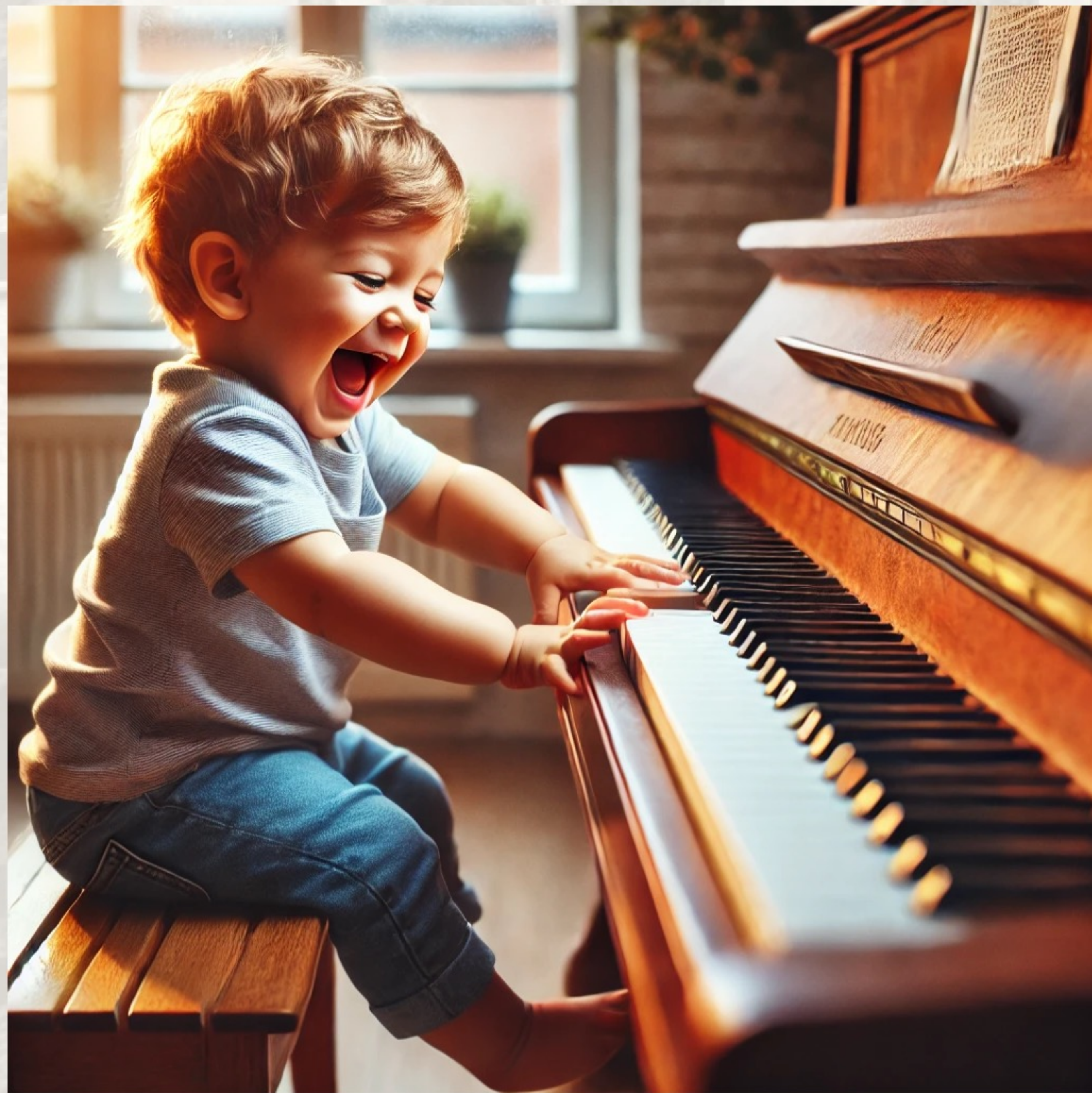
AI generated image